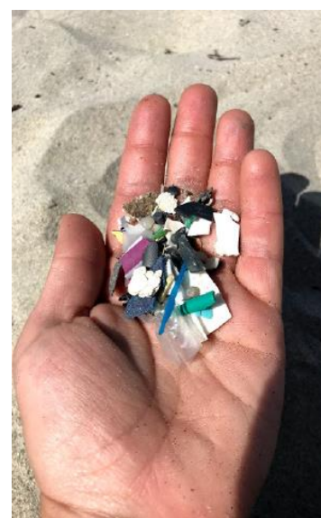
The plastic that Constanza found on the beach in California

My research involves the ocean, fur seals and faeces. Thanks to the US bursary award, I was also able to go to California to pick up fish samples collected from the south pacific. These fish are an important part of the fur seals diet. Therefore, these samples will contribute to looking at the fur seal diets and its contribution to pollution exposure.