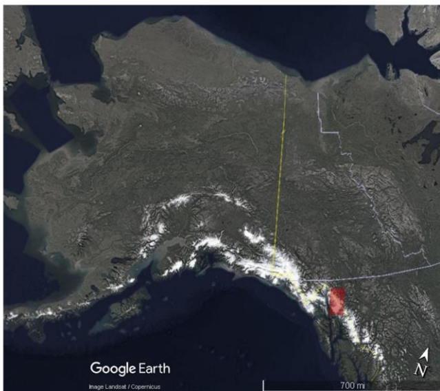
Location map of the Juneau Icefield, SE Alaska